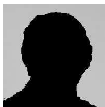
Vacant Parent Governor Representative